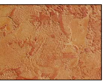
20-65 Sedona Red Standard Color