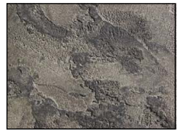
20-71 Black Standard Color