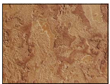
20-67 Sienna Standard Color