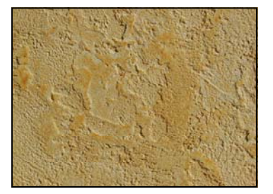
20-63 Sand Stone Standard Color