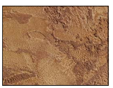
20-64 Umber Standard Color