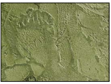
20-68 Green Slate Standard Color