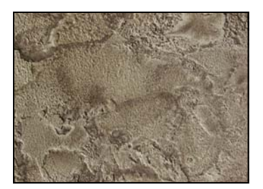
20-62 Gray Slate Standard Color